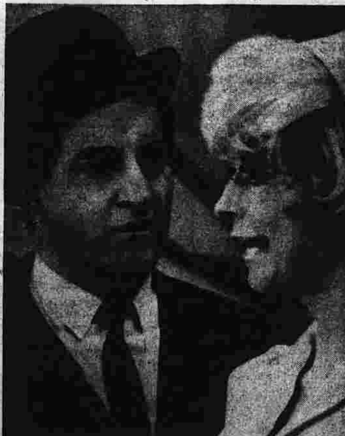
Danny Thomas and Carol Channing in a skit on NBC's "Wonderful World of Burlesque" Sunday 9-10 p.m.

"The Hill Country: Lyndon Johnson's Texas," a one-hour tour by the President of the country he grew up in, will be rebroadcast Sunday, 6:30-7:30 p.m. on NBC. . . . The international competition to build a supersonic airliner is explored in CBS' "The Supersonic Race" Tuesday, 10-11 p.m. . . . Michael Caine, Elke Sommer, Jayne Mansfield and other film stars appear briefly in a visit by Bob Hope to Acapulco on his NBC show Wednesday, 9-10 p.m.